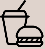
Food & Beverages

Halal Trade, Logistics and Manufacturing Expo will further strengthen Africa's position as a global halal hub and put forward the economic values of Halal for the world.